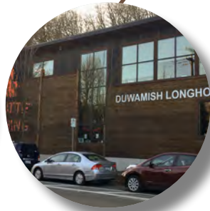
DUWAMISH LONGHOUSE & CULTURAL CENTER Seattle, WA