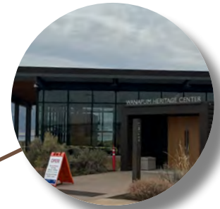
WANAPUM HERITAGE CENTER Mattawa, WA