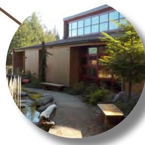
SQUAXIN ISLAND MUSEUM LIBRARY & RESEARCH CENTER Shelton, WA