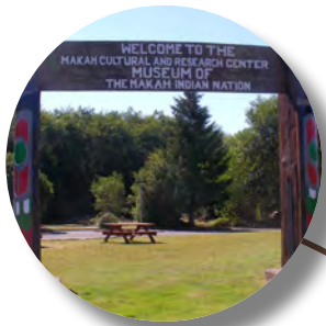
MAKAH MUSEUM Neah Bay, WA