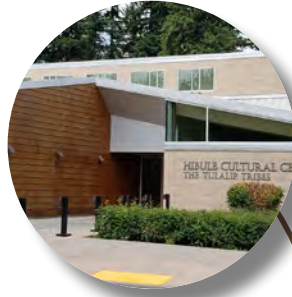
HIBULB CULTURAL CENTER Tulalip, WA