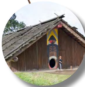
CATHLAPOTLE PLANKHOUSE Ridgefield, WA