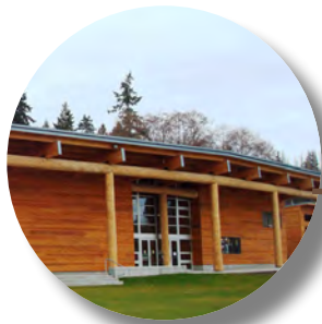
SUQUAMISH MUSEUM Suquamish, WA