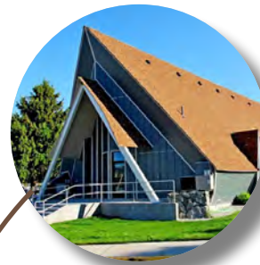
COLVILLE TRIBAL MUSEUM Coulee Dam, WA