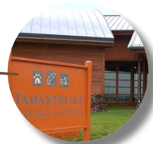
TAMASTLIKT CULTURAL INSTITUTE Pendleton, OR