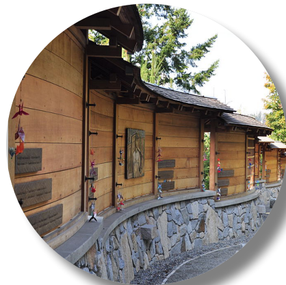
BAINBRIDGE ISLAND JAPANESE EXCLUSIONARY MEMORIAL Bainbridge Island, WA