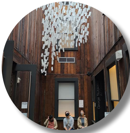
WING LUKE MUSEUM OF THE ASIAN PACIFIC EXPERIENCE Seattle, WA