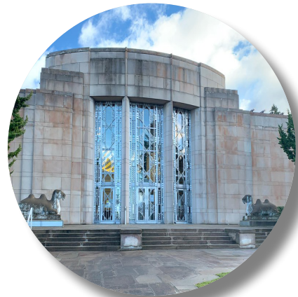
SEATTLE ASIAN ART MUSEUM Seattle, WA

Filipino American National Historical Society