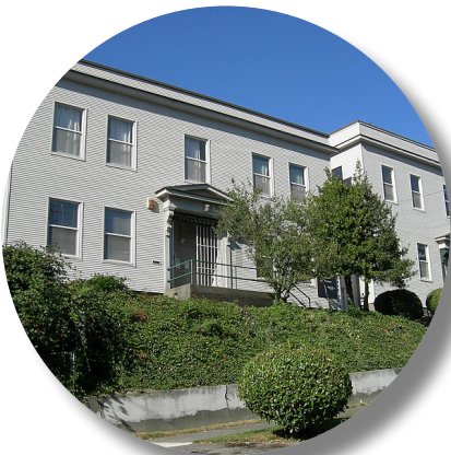
JAPANESE CULTURAL COMMUNITY CENTER Seattle, WA

Museum of History and Industry: Beyond Bollywood, Indian Americans Shape the Nation